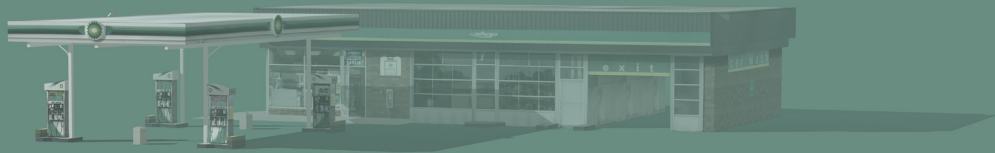
Untitled 88 | 2023