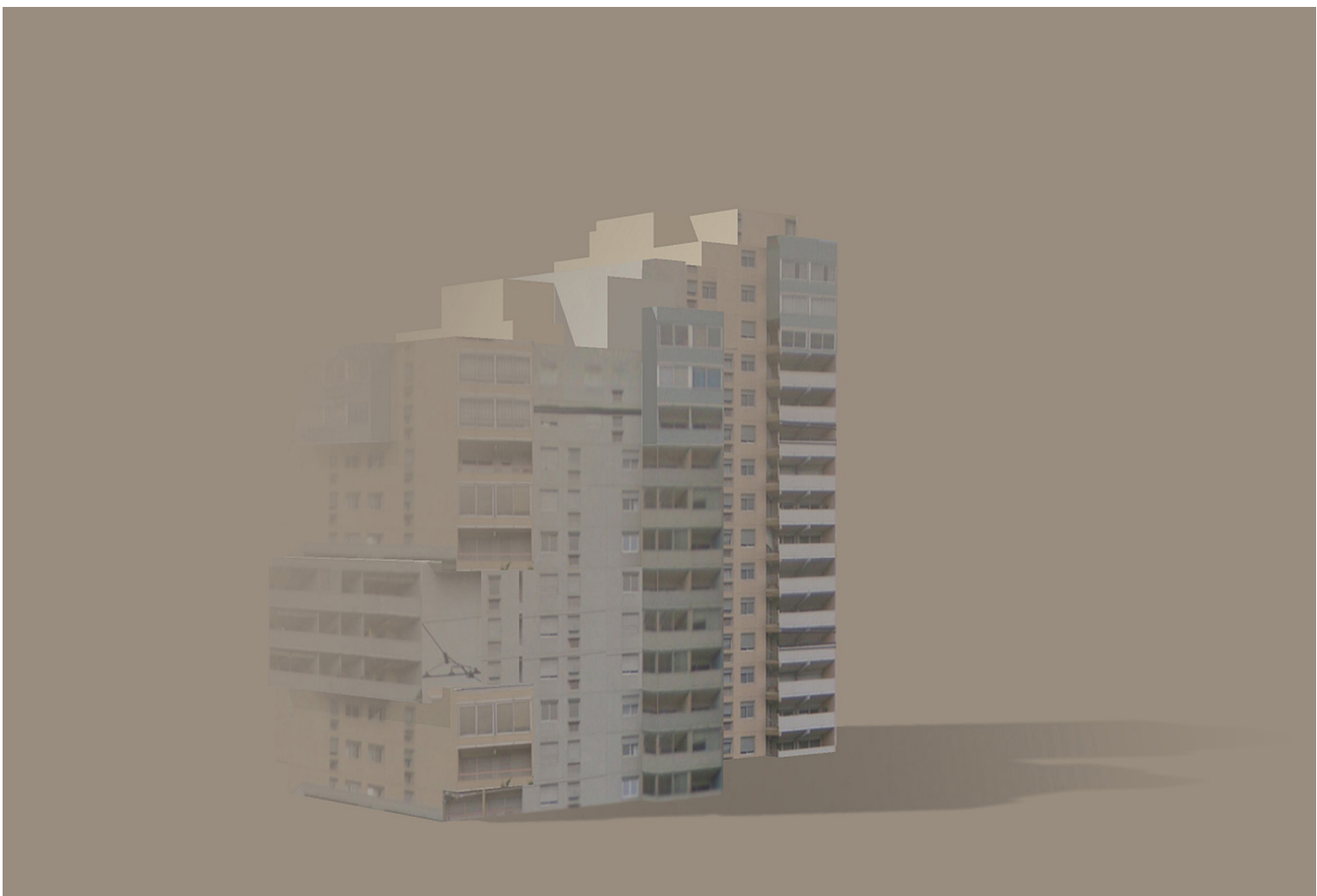
Untitled 24 | 2014